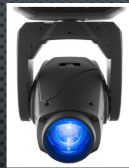
MAVERICK MK1 SPOT