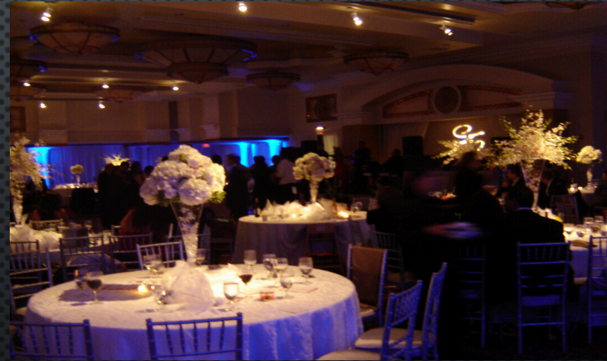
BEAUTIFUL CENTER PIECES POP WHEN PIN SPOTS ARE USED.