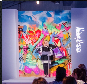
16 TH BIRTHDAY