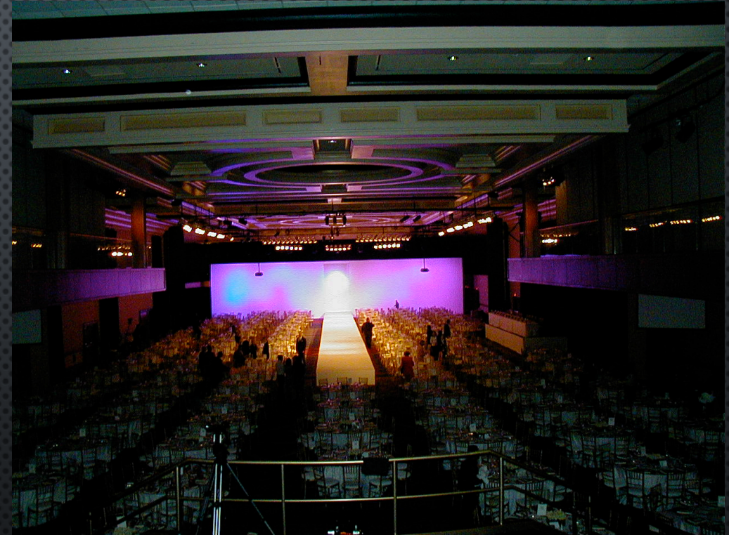
Main Ballroom – Wardman Park Marriott, Washington DC.