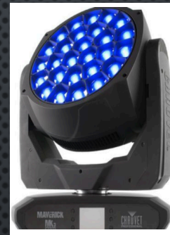
MAVERICK MK3 WASH