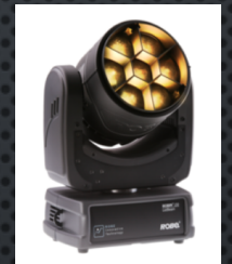
LED BEAM 150