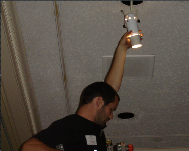
CAREFUL PLACEMENT AND FOCUS CAN ENHANCE THE LOOK OF YOUR EVENT SPACE.

A PINSPOT IS A STAPLE IN THE LIGHTING BUSINESS. THIS SMALL FIXTURE PROVIDES A FOCUSED BEAM OF LIGHT THAT CAN BE USED TO ILLUMINATE FLORAL ARRANGEMENTS, WEDDING CAKES, ICE SCULPTURES AND TABLES. THEY COME IN A VARIETY OF TYPES AND COLORS. IN ADDITION TO TRADITIONAL PINSPOTS WE OFFER SWIVELIERS WHICH REPLACE EXISTING BALLROOM DOWNLIGHTS AND PROVIDE A FOCUSED BEAM OF LIGHT FROM ABOVE.