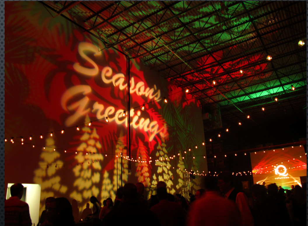
Warehouse Space – Baltimore Maryland.