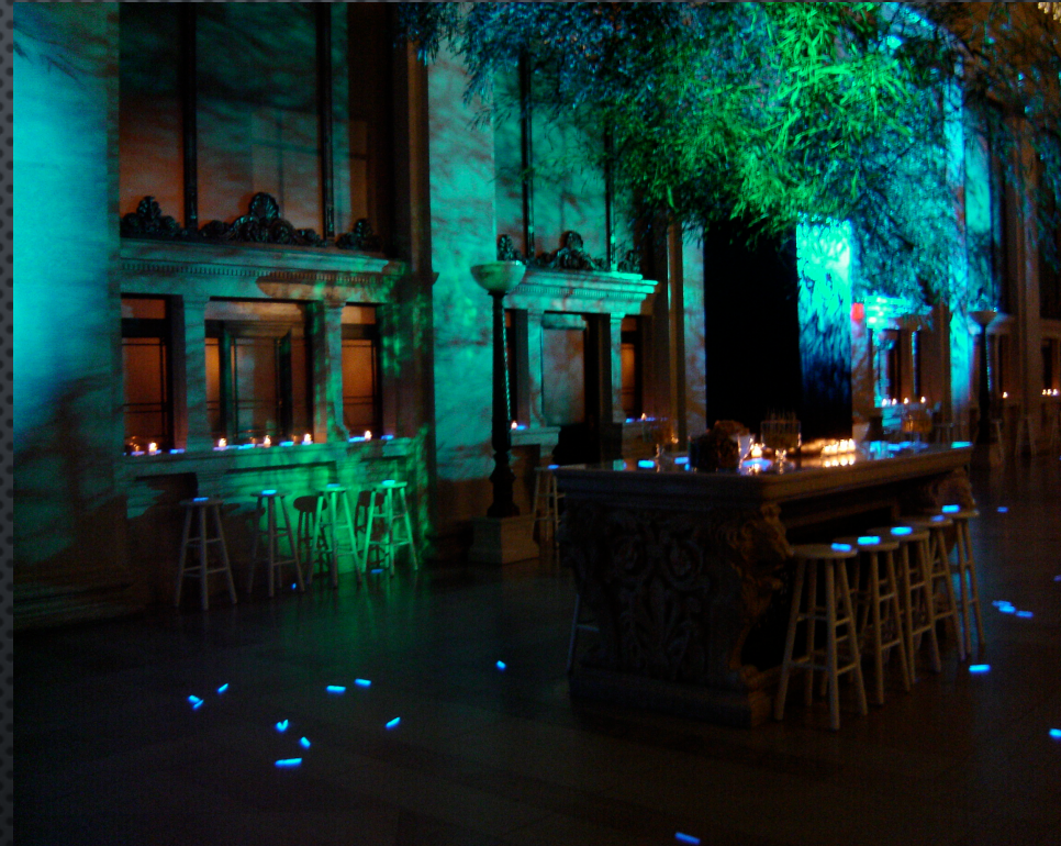
Old Post Office Building, Washington DC.