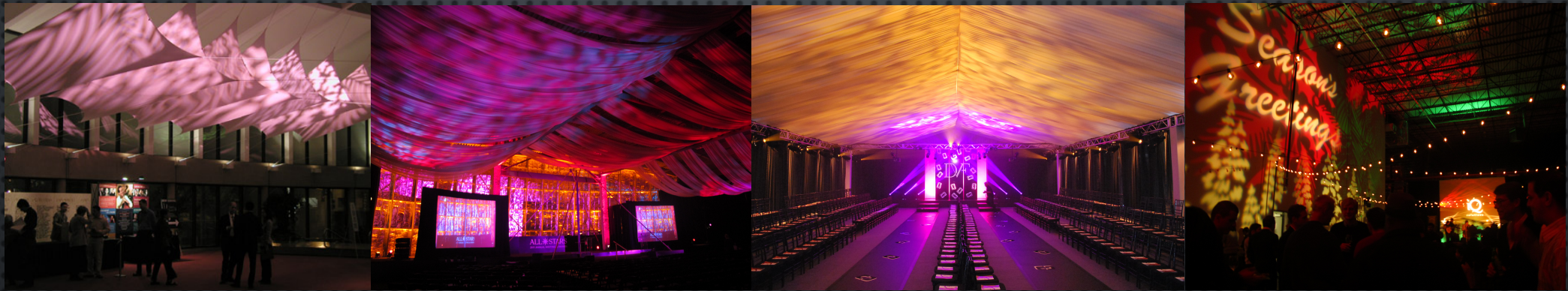
SUBTLE TEXTURED WASH WITH GOBOS SLIGHTLY OUT OF FOCUS TO SOFTEN THE LOOK. THIS ALSO CREATES GREAT AMBIENT LIGHT IN THE SPACE.

USING A GOBO WITH A PATTERN WE CAN CREATE A TEXTURED WASH ON THE CEILING OF A TENT, WALL OF A BUILDING, OR ACROSS THE TABLES AT A RECEPTION. THESE PATTERNS CAN BE VERY GRAPHIC OR SUBTLE BLURRED IMAGES MEANT TO ADD TO THE EVENTS' ATMOSPHERE. COLOR CAN ALSO BE ADDED TO THE FIXTURE TO FURTHER ENHANCE THE EFFECT.